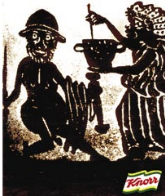
Bolotian - 400 B.C. Ashmolean Museum Oxford