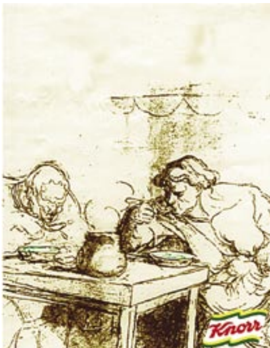
Soup - 1860 by Honore Daumier