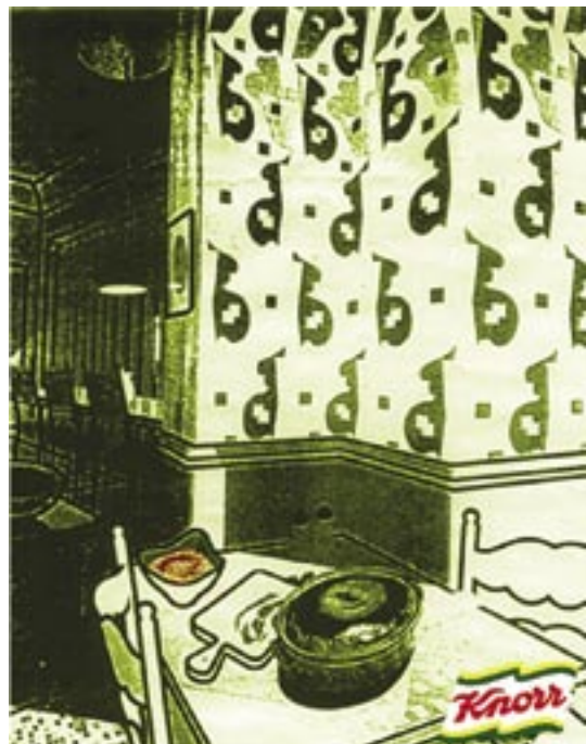
Dining/kitchen/Living - 1980 by Patrick Caulfield